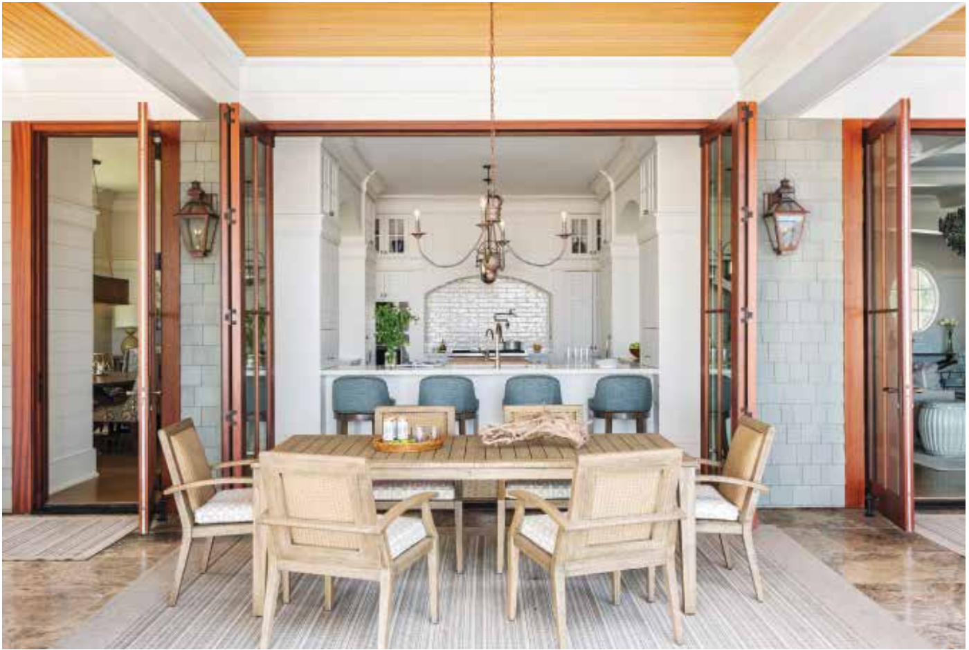
EATING IN & OUT: A floating kitchen anchors the home, tying the indoor and outdoor living spaces together. The alfresco Lloyd Flanders dining table and chairs, purchased at GDC Home, is as accessible to the chef as the formal dining room. The kitchen features a Boos Block island and industrial-style pendant lights from Urban Electric. Hidden behind the main kitchen area is an innovative butler's pantry, resplendent with floor-to-ceiling cabinets designed by Robert Paige Cabinetry.