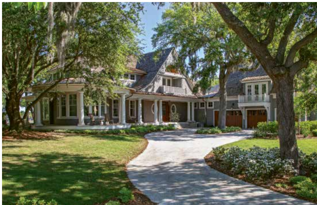
MADEINTHESHADE: With "the Kiawah look" in mind, Suzie and Mark Dajani built their dream home—a blend of Northeastern shingle-style architecture with classic Southern touches—on James Island. The infinity pool (left) appears to spill into the marsh and Intracoastal Waterway.

The merging of exterior and interior begins with the windows, which showcase vistas of the creek and golf course from every room, and culminates in a wide-open living space. Between the living room, kitchen, dining room, and the 2,700-square-foot deck there are no walls—just a long line of retractable floor-to-ceiling windows that melt away to create a spectacular open space, perfect for entertaining. "We initially thought about downsizing," explains Suzie, "but we wanted a