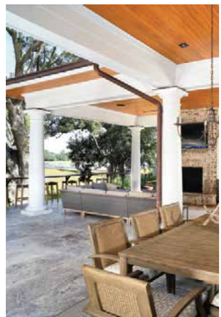
PHOTOGRAPHS (KITCHEN ISLAND & OUTDOOR LIVING ROOM) COURTESY OF McDONALD ARCHITECTS